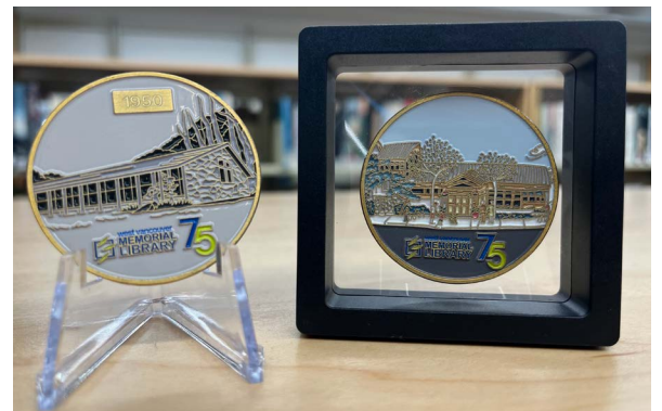
Special commemorative coins celebrating 75 years of WVML.