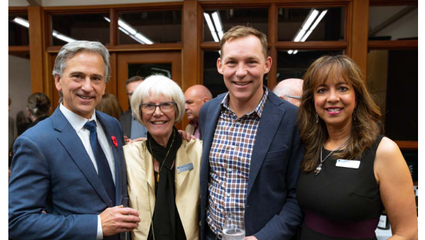
Celebrating WVML's 75th year.