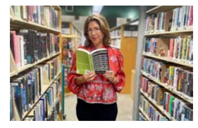
Renowned author Naomi Klein enthralled audiences last September as she read from her latest book.