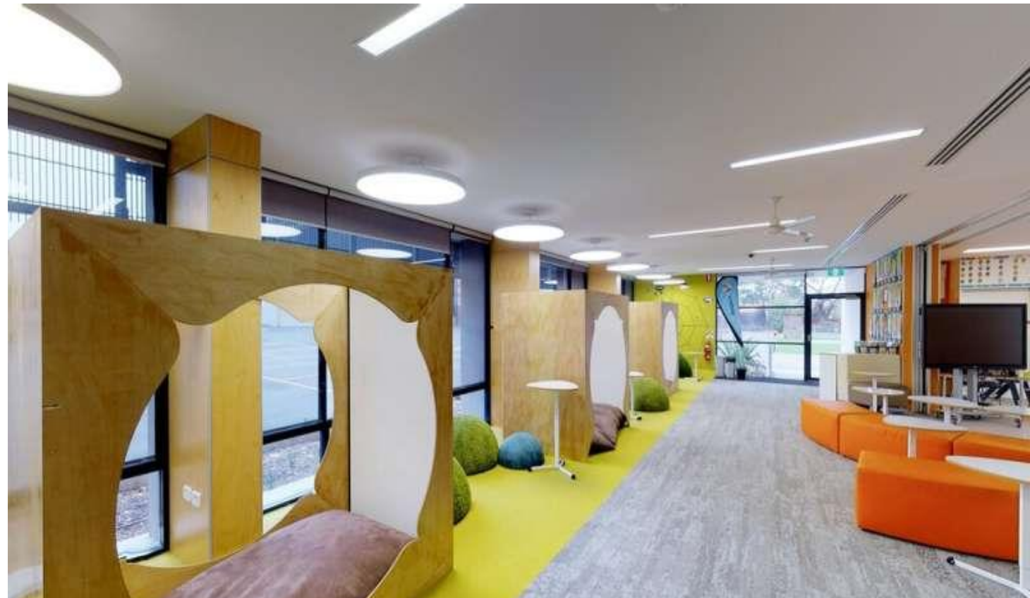
Photos clockwise from top: Salt Lake City Public Library Chicago Public Library The Conversation The Blue School, Manhattan